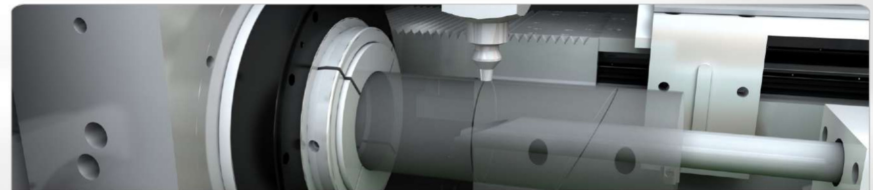
Bevel, punch, cut off Multifunctional cutting, not just cutting