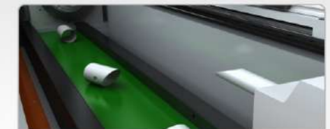
Track collection realizing continuous and uninterrupted processing