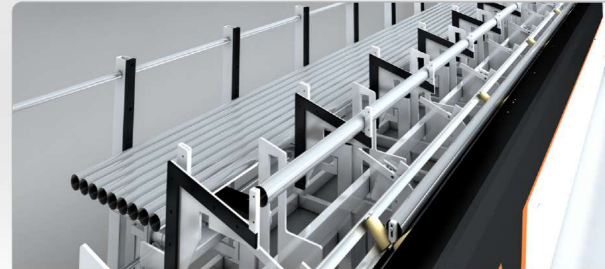
Batch round pipe auto loading